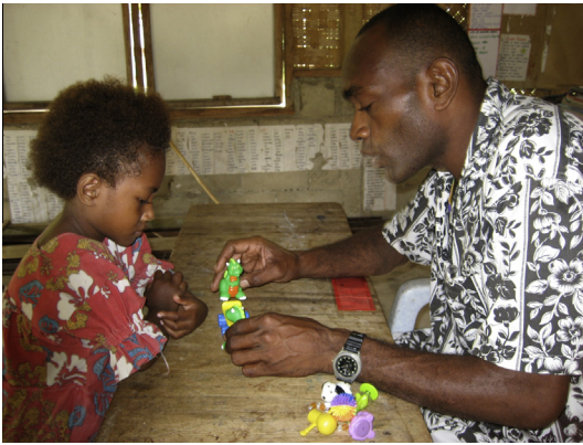
Fig. 1. Five-year-old being tested on the island of Motalava, Vanuatu.

Except in Vanuatu (see Section 2.7), all testing sessions were videotaped using a small Canon digital camera for later analysis and reliability assessment. The camera rested on a tripod three to five meters away and provided an overhead side view of child and experimenter, who faced each other at a table across a distance of one to two meters (see Fig. 1).